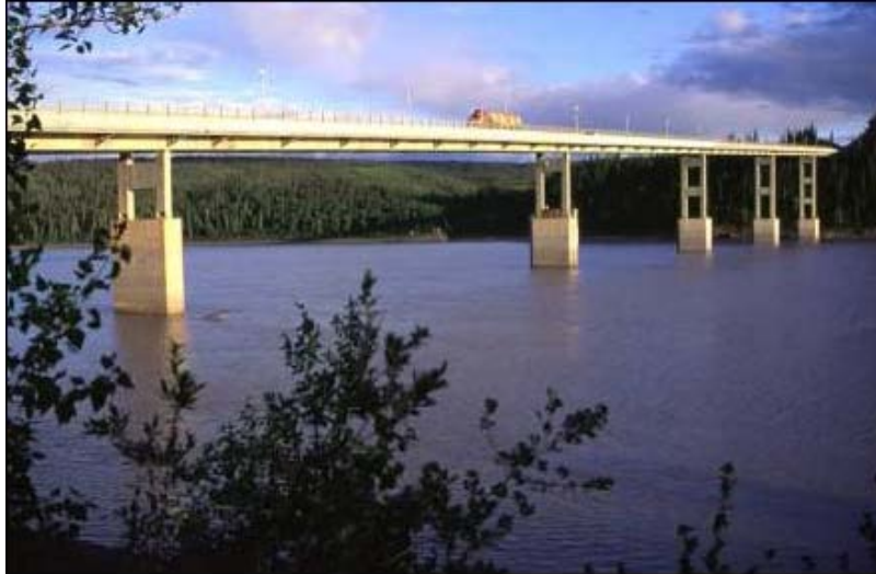
Figure 1: Yukon River Bridge.