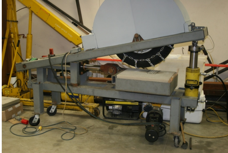
Figure 2: Traction and chain-wear test equipment.

work with the data collector to allow for calibration and corrected readings. The apparatus is approximately 23.62 in. (60 cm) wide and 90.55 in. (230 cm) long and weighs around 4,500 lb (20 kN). The tray of the test machine is 18 in. (45 cm) wide by 24 in. (61 cm) long by 5.91 in. (15 cm) thick. Figure 2 is a picture of the traction chain-wear test equipment.