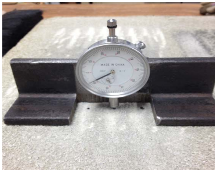
Figure 3: Gouge depth measurements.

*Experienced major chain rolling damage at center of test panel